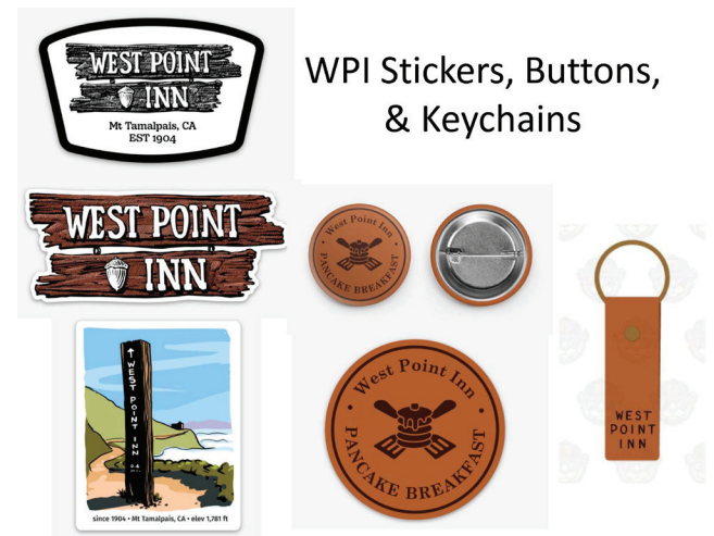
WPI Stickers, Buttons, & Keychains