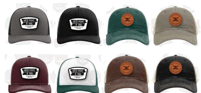
WPI Patch Hats