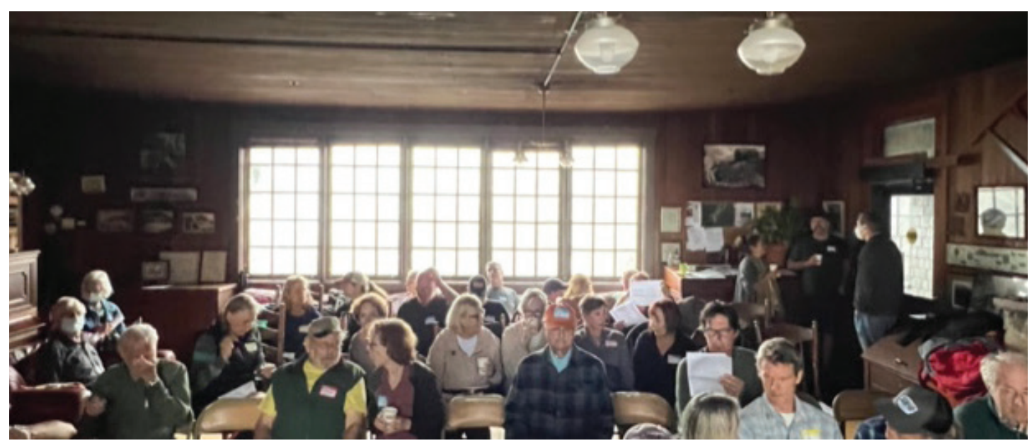
The Member's Lounge ceiling hangs low above the heads of the members at the meeting October 22nd.