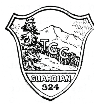
TCC emblem used in all TCC publications from the earliest days.