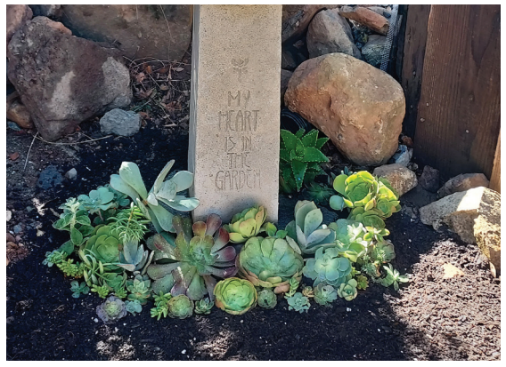
The succulents are spreading!