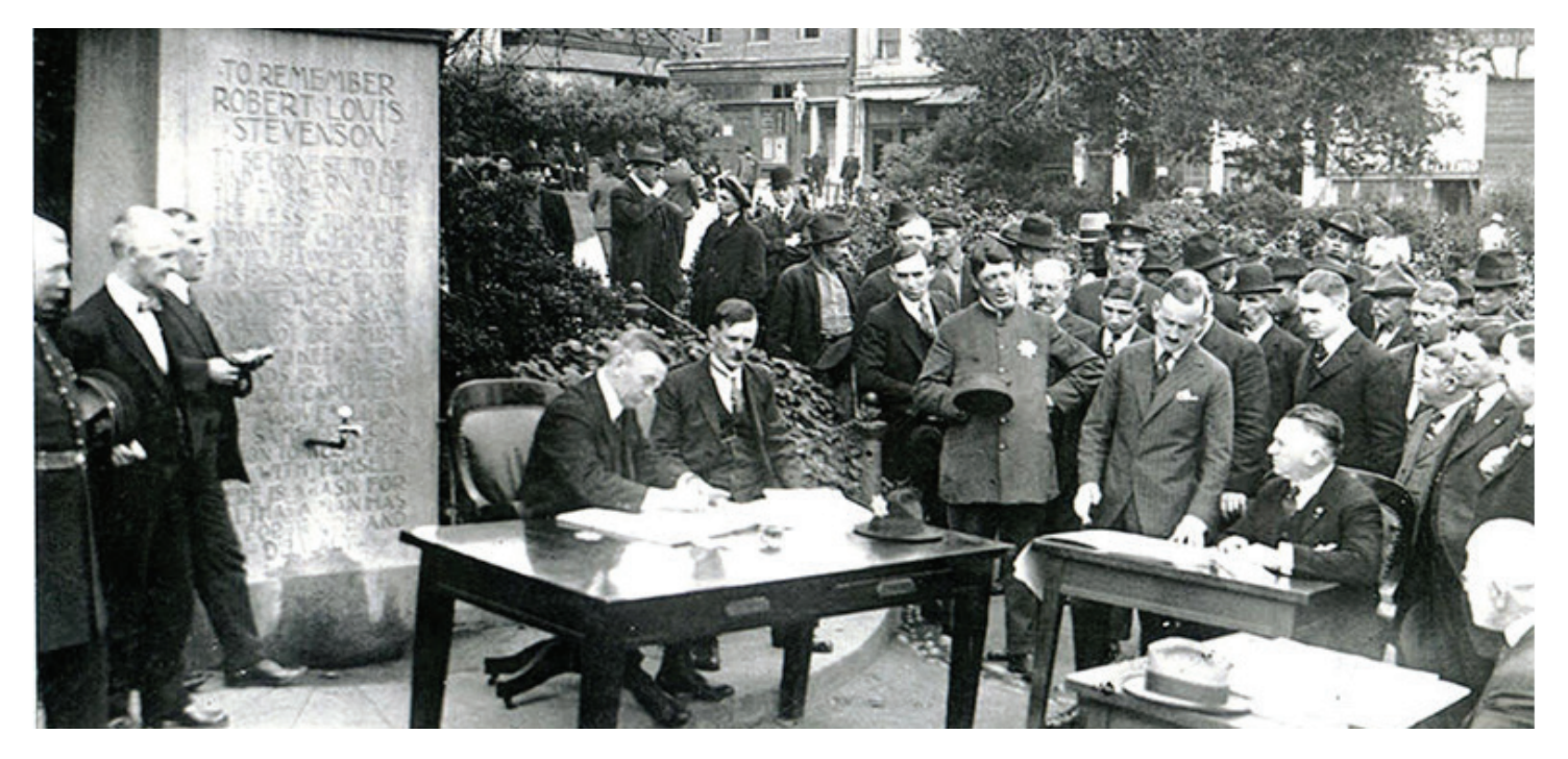
1918: To prevent crowding indoors, judges held outdoor court sessions such as this open-air police court being held in Portsmouth Square, San Francisco.